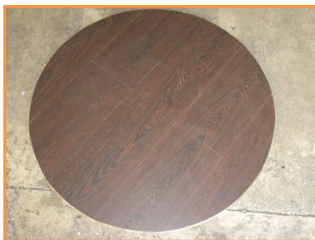
IL30hg with Adore LVT before testing