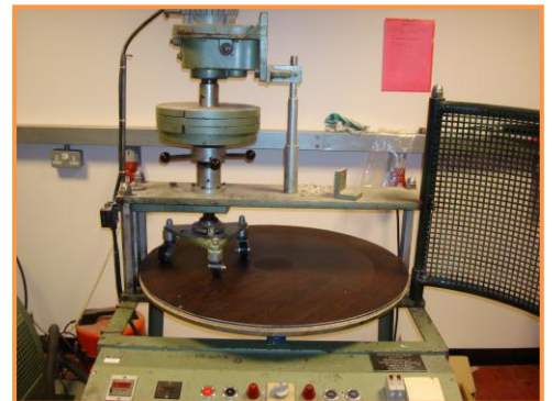
Castor wheel test in progress

The test proved that InstaLay is suitable for use beneath LVTs, where an acoustic, anti-fatigue floor finish is required. InstaLay 30hg is able to bond the flooring and support the LVT joints, even under the most demanding conditions. Despite this very positive result, it is still always recommended that a protection mat be used under castor wheels in order to protect the floor finish throughout its useful life.