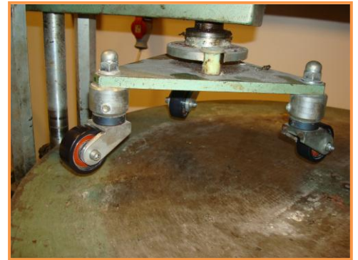
Castor wheel configuration